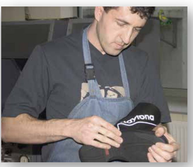
After all work steps, material and processing are checked. The final inspection checks the finished boot.